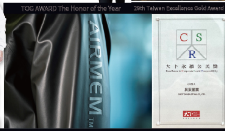
29th Taiwan Excellence Award