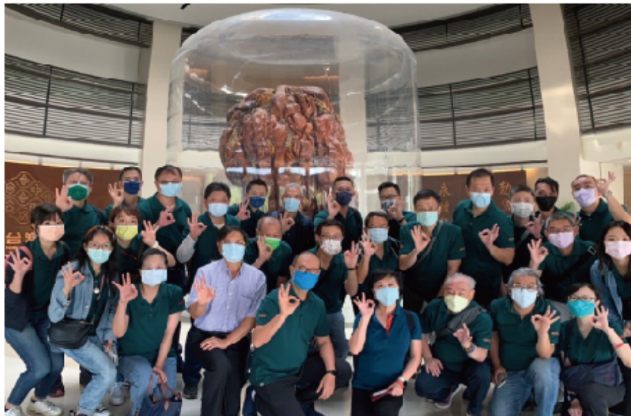
Photographed / Text = Dawn Lin

SINGTEX invited a total of 28 senior executives as the first delegation to visit Formosa Plastics for learning and observation on October 2. The second delegation is scheduled for November. Other colleagues will be invited to this educational itinerary.